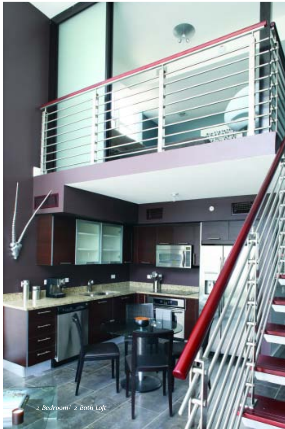
2 Bedroom/ 2 Bath Loft

Brickell on the River residents will enjoy a choice of two fabulous pools, and an unbelievable five-level health and fitness center, located directly on the River. The amenities rival that of any exclusive club.