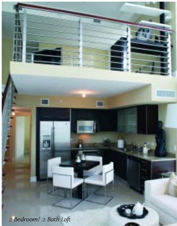
2 Bedroom/ 2 Bath Loft

Miami Today's "Salute To Brickell" reported that the average price per square foot of a unit on Brickell as of August 2007 is $528 per square foot.