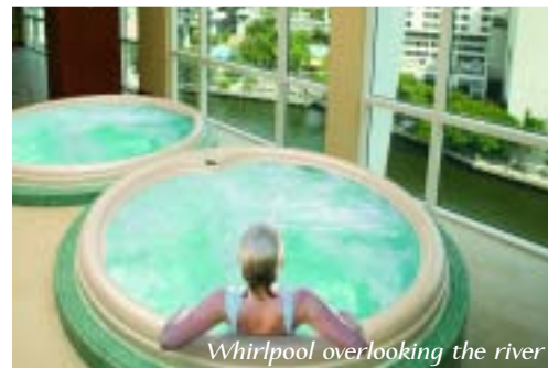
Whirlpool overlooking the river

For more information, call 305 381-9220 or visit www.brickellontheriver.com .