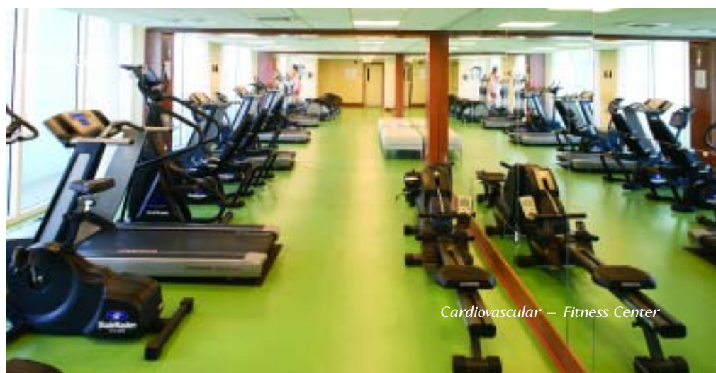
Cardiovascular - Fitness Center