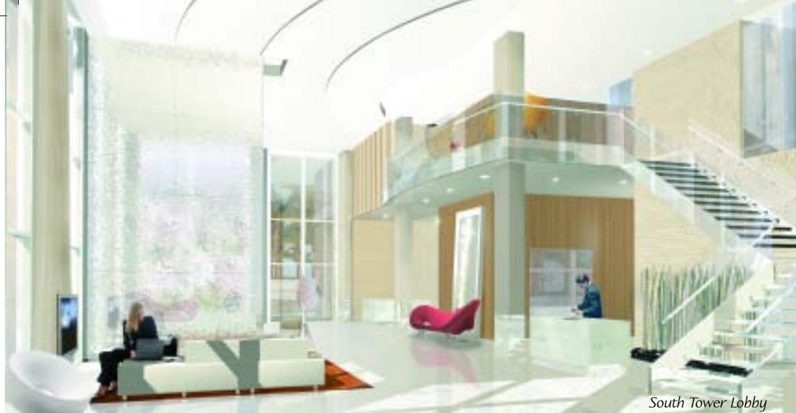
South Tower Lobby