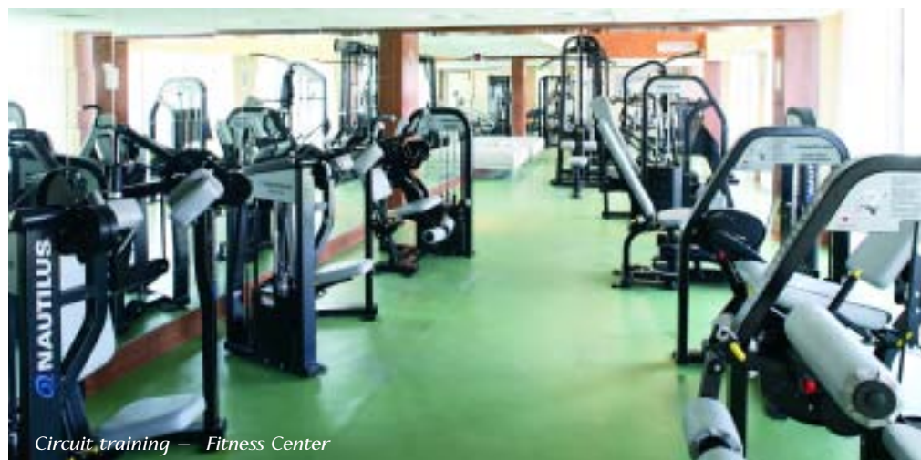
Circuit training - Fitness Center