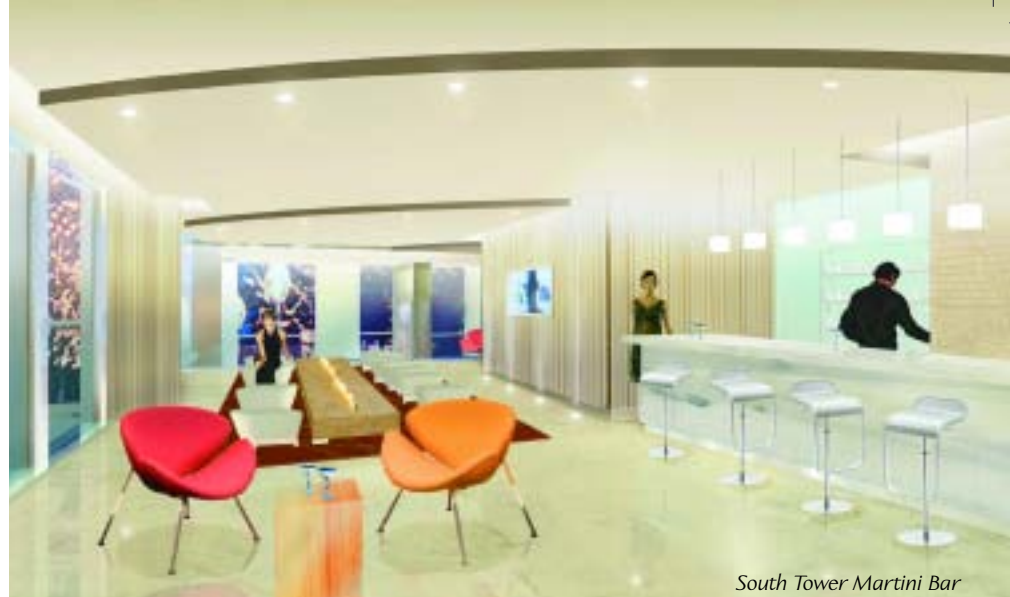
South Tower Martini Bar

Congratulations !!!!!!! Brickell on the River South is spectacular and the latest architectural masterpiece to be built by the incomparable Groupe Pacific, one of the most outstanding developers in North America. Every home is two stories with approximately 17 feet of glass. Enjoy the most panoramic views of City lights, Brickell, the Bay and South Beach.